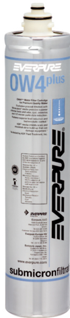
OW4-Plus Replacement Cartridge: EV9635-01

Delivers premium quality drinking water for bottleless coolers and drinking fountains