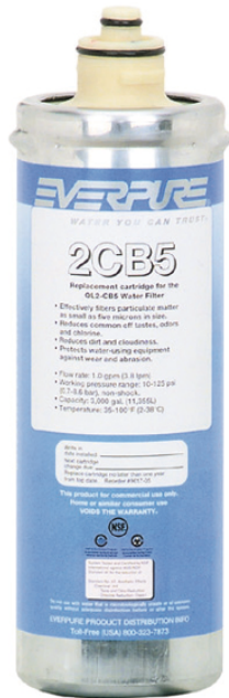
2CB5 Replacement Cartridge: EV9617-05

Delivers quality water for foodservice, vending and OCS applications