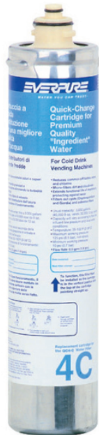
4C Replacement Cartridge: EV9600-00 (1-pack) EV9601-00 (6-pack)

Delivers premium quality water for cold cup vending applications