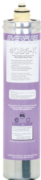
4CB5-K Replacement Cartridge: EV9617-36

Delivers quality water for foodservice, vending and OCS applications