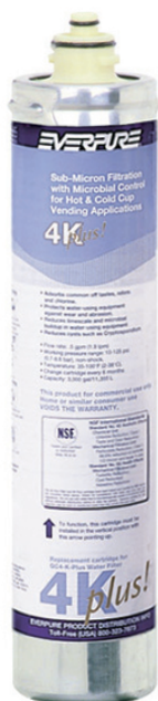
4K-Plus Replacement Cartridge: EV9612-71

Delivers premium quality water for foodservice, vending and OCS applications