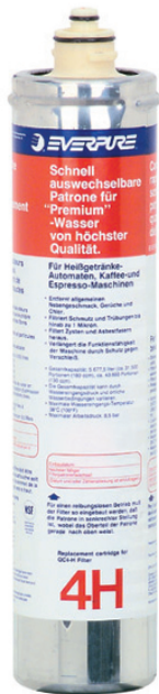
4H Replacement Cartridge: EV9610-00 (1 pack) EV9611-00 (6 pack)

Delivers premium quality water for hot cup vending applications